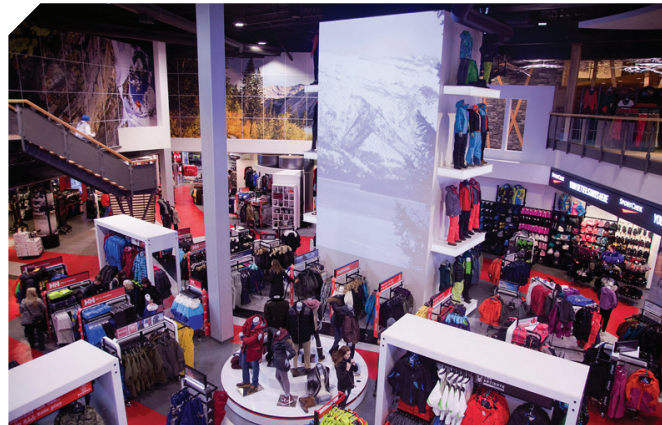
Interactive technology and digital installations are woven throughout Sport Chek’s flagship in West Edmontall Mall, Edmonton, Alberta.